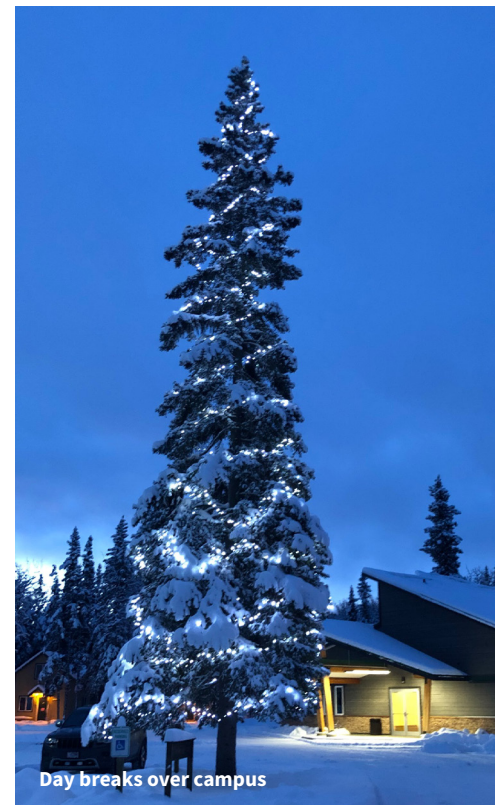
Day breaks over campus