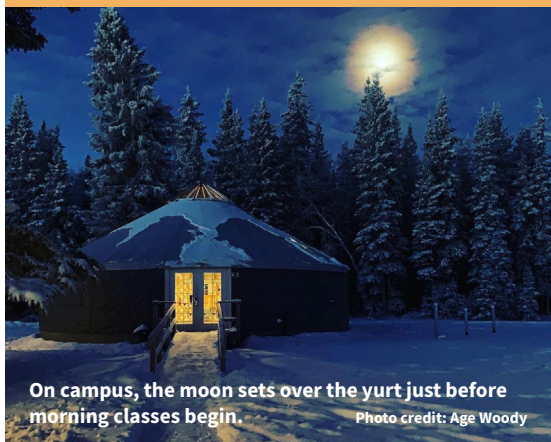
On campus, the moon sets over the yurt just before morning classes begin.