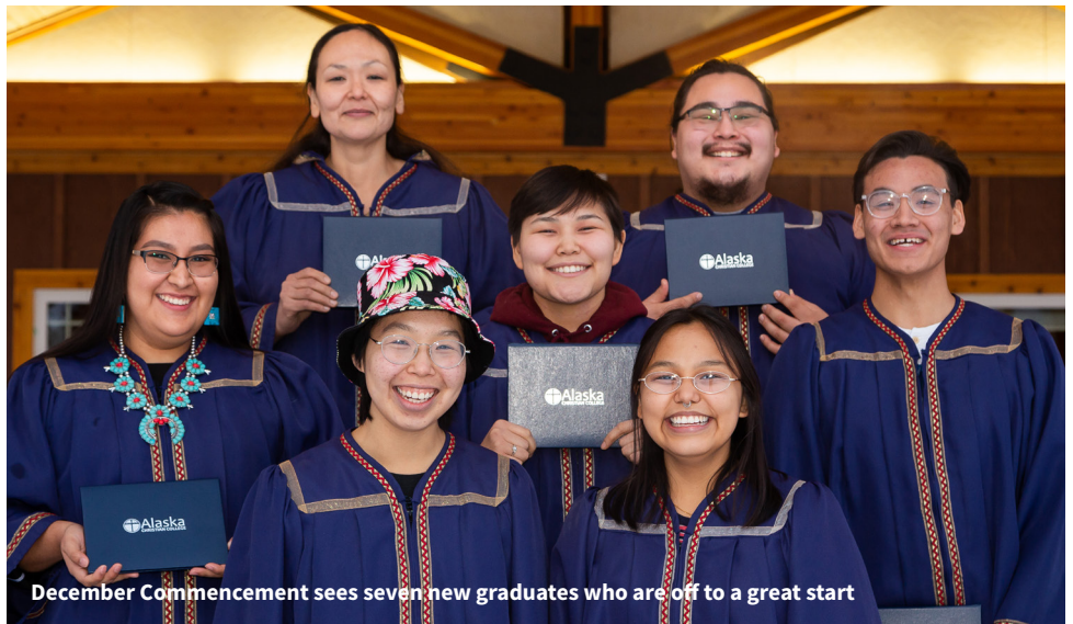
December Commencement sees seven new graduates who are off to a great start

ACC's VISION 2020 CAPITAL CAMPAIGN raises $3.75 million during Quiet "Leadership" Phase. The classroom addition is nearly completed and this fall, a groundbreaking ceremony began work on the new athletic center. (more details inside)