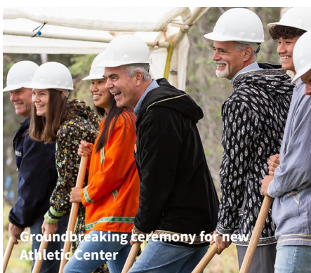
Groundbreaking ceremony for new Athletic Center