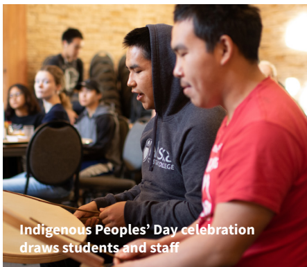
Indigenous Peoples' Day celebration draws students and staff